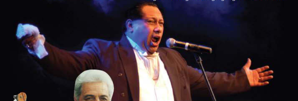
Ngāti Kahungunu singing legend - Ash Puriri