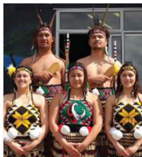
Uhi Tai Ohi - Ki Taneatua Cultural and Dance Roopu