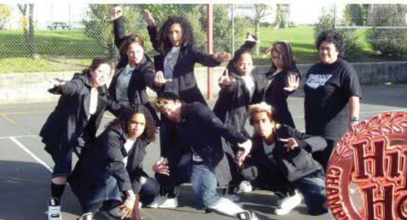
'Fearless' Hip Hop Group World Bronze Medal Champions