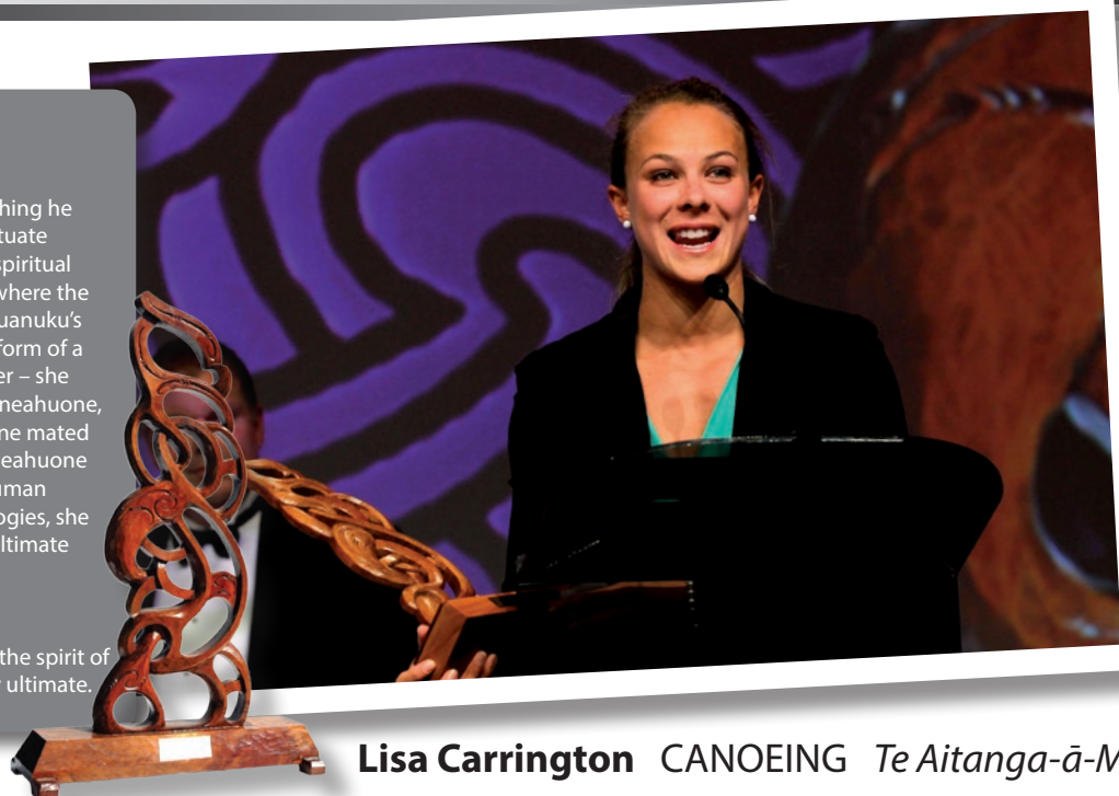
Lisa Carrington CANOEING Te Aitanga-ā-Māhaki

It is for this reason that the Māori Sportswoman should be named in the spirit of an illustrious beginning, she is truly ultimate.