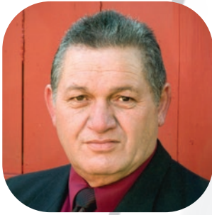
Te Arikini Kiingi Tuheitia Patron