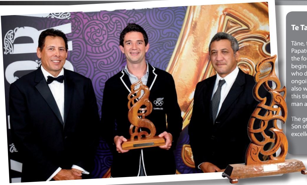
Storm Uru ROWING Ngāi Tahu