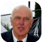
Sir Tamati Reedy