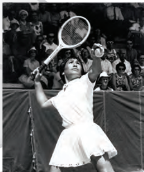
The return of Ruia Morrison to Wimbledon 2013: Fifty-three years after reaching Wimbledon women's quarter-finals.