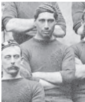
2013 Inductee – Māori Sports Hall of Fame: Jack Taiaroa (Ngāi Tahu) – rugby, cricket, athletics