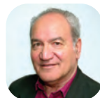
Pine Harrison Chair