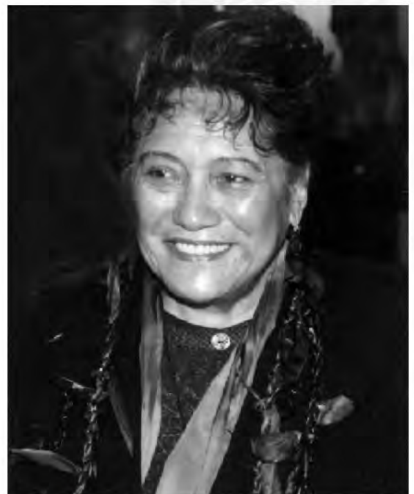
Te Arikinui Dame Te Atairangikaahu