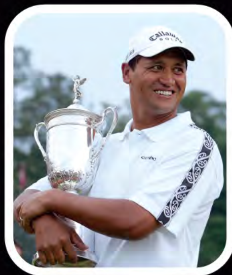
Michael Campbell Ngati Ruanui, Ngati Rauru