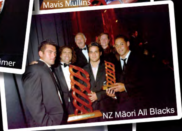
NZ Māori All Blacks