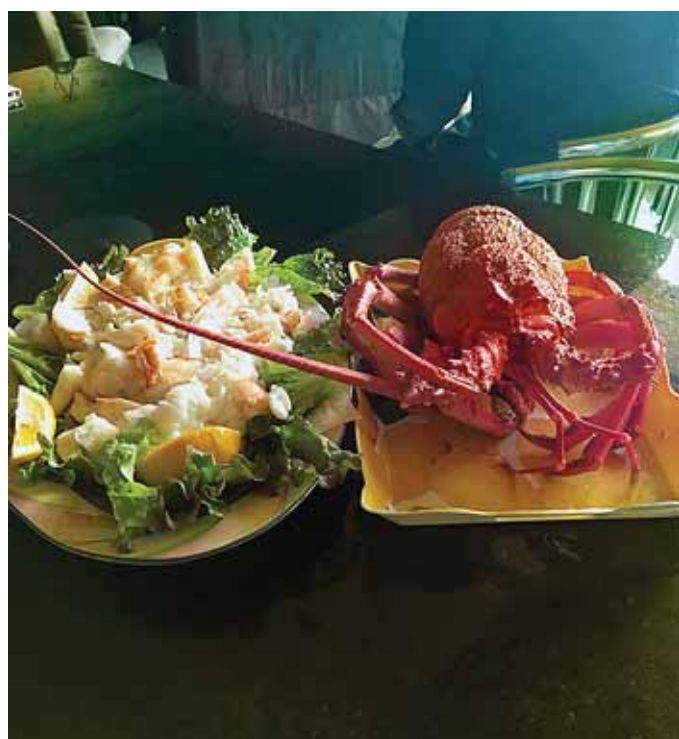
How's this for a feed of crayfish for lunch?