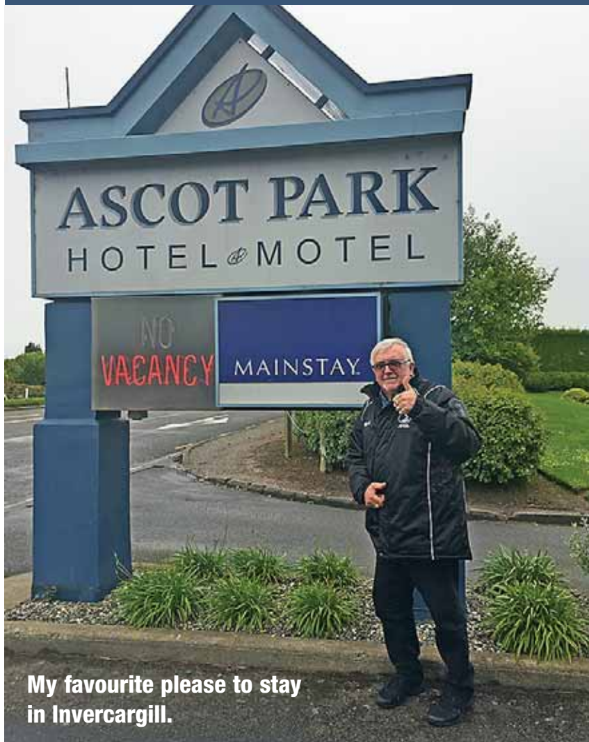
My favourite place to stay in Invercargill.