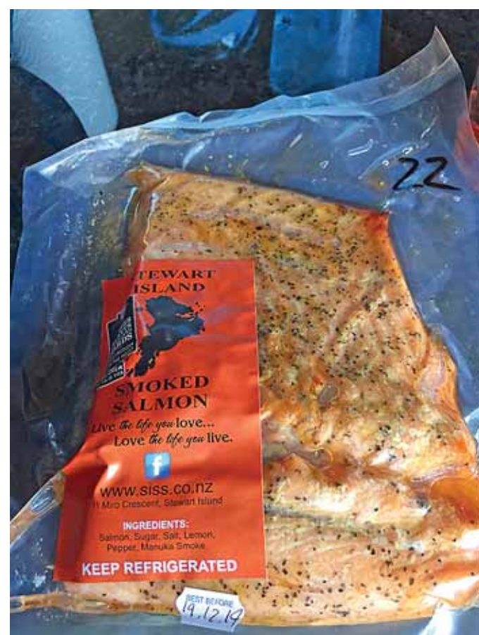
Stewart Island smoked salmon.