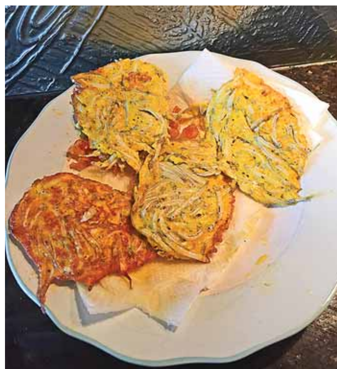
Whitebait fritters. Lovely!