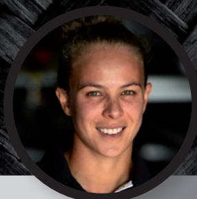
Lisa CARRINGTON Ngati Porou, Te Aitanga-a-Mahaki