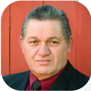
Te Arikini Kiingi Tuheitia Patron